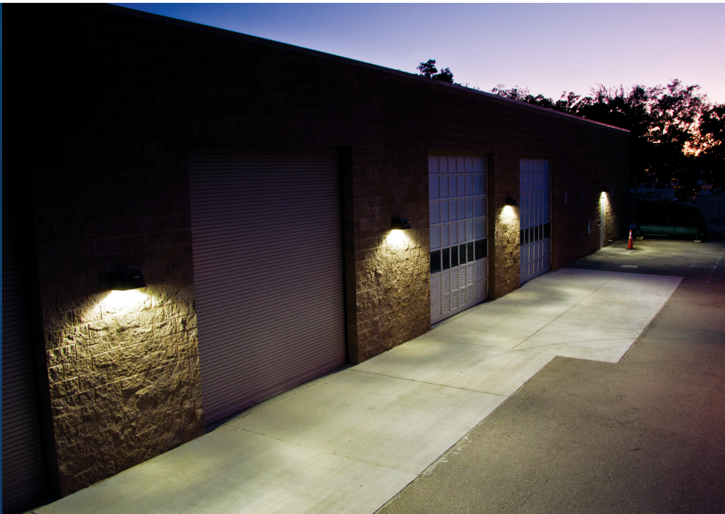
Post-retrofit network-controlled LED wall packs line the Thermal Energy Storage building at UC Davis